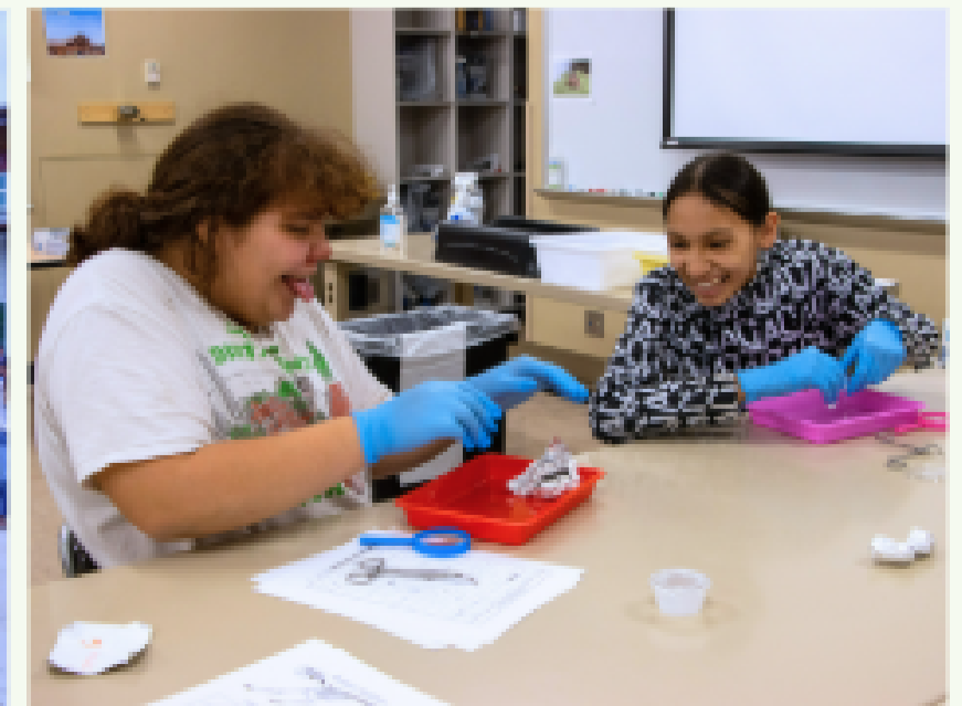
PARTICIPANTS FROM BROWNING MIDDLE SCHOOL ENGAGED IN SCIENCE DAY ACTIVITIES INVOLVING DNA, DRONE, AND OWL PELLET INTERACTIONS