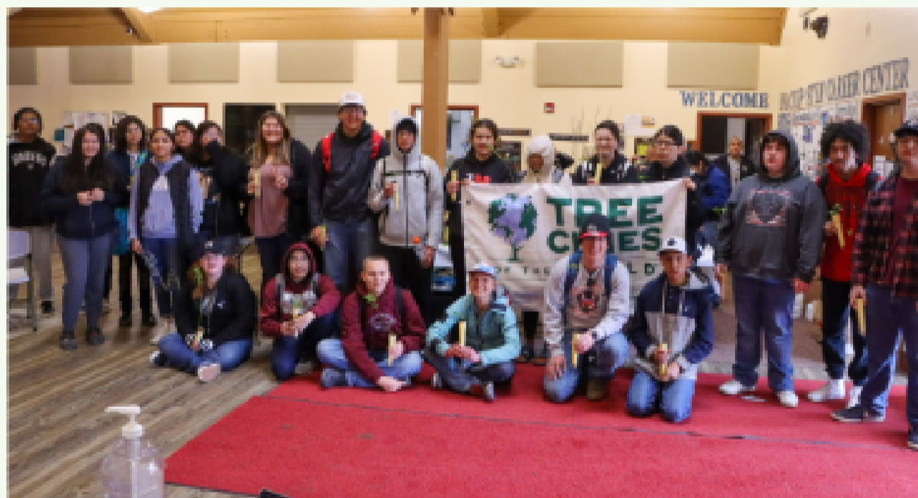
BROWNING HIGH SCHOOL ARBOR DAY ATTENDEES

BNACTEP RECENTLY HOSTED AN INTERACTIVE WORKSHOP CENTERED ON DEVELOPING CRUCIAL SOFT SKILLS. ATTENDEES HAD THE CHANCE TO EXPLORE TOPICS LIKE CONFLICT RESOLUTION, CUSTOMER SERVICE, LIFE SKILLS ENHANCEMENT, TIME MANAGEMENT, AND FOSTERING POSITIVE EMPLOYER/EMPLOYEE RELATIONS. IT WAS A FANTASTIC OPPORTUNITY FOR EVERYONE TO GROW PERSONALLY AND PROFESSIONALLY! THE PRESENTATIONS WILL BE AVAILABLE FOR VIEWING ON OUR WEBSITE AND YOUTUBE CHANNEL.