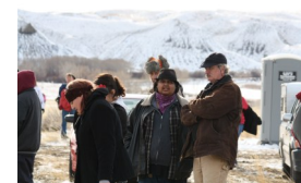
Bear River Massacre Commemoration 2012

Remember, you're not alone. Choosing a major is usually done with the help of academic and peer advisers.