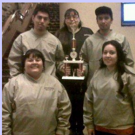
Critical Inquiry Team AIHEC 2011